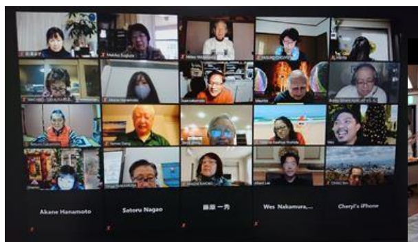
Mele Kalikimaka (Merry Christmas)

It would be so happy if we would be able to perform hula at the International Convention 2022 in Honolulu.